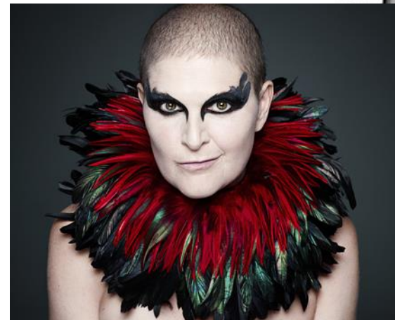
Rankin ALIVE: In the face of death